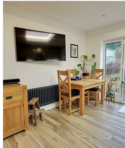
A stunning two bedroom bungalow within walking distance of both Kings Langley High Street and Station.